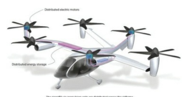
Each of these units is connected to two separate batteries.