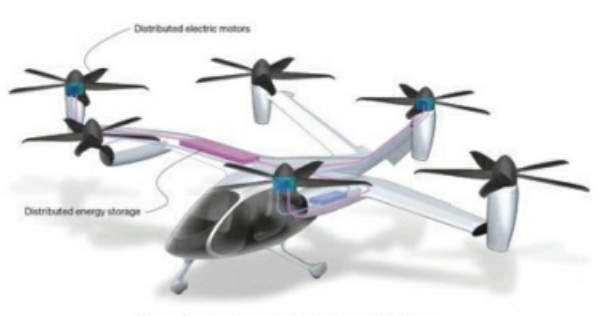
The aircraft's six propulsion units are distributed across the airframe. Each of these units is connected to two sensate batteries

We expect the electrification of transportation to accelerate and extend to the skies in the decade ahead, representing a place where technology, economy, and sustainability converge. Applying electrification to small aircraft unlocks new degrees of freedom in design that were not possible with traditional, combustion engines. Using multiple small electric motors (which has been called "distributed electric propulsion") rather than a single central engine enables a new class of quiet, safe, and economical vertical takeoff and landing aircraft that were previously infeasible.