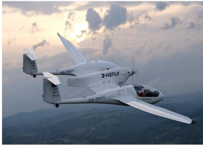
H2FLY completed the world's first piloted flight of a liquid hydrogen-powered electric aircraft.