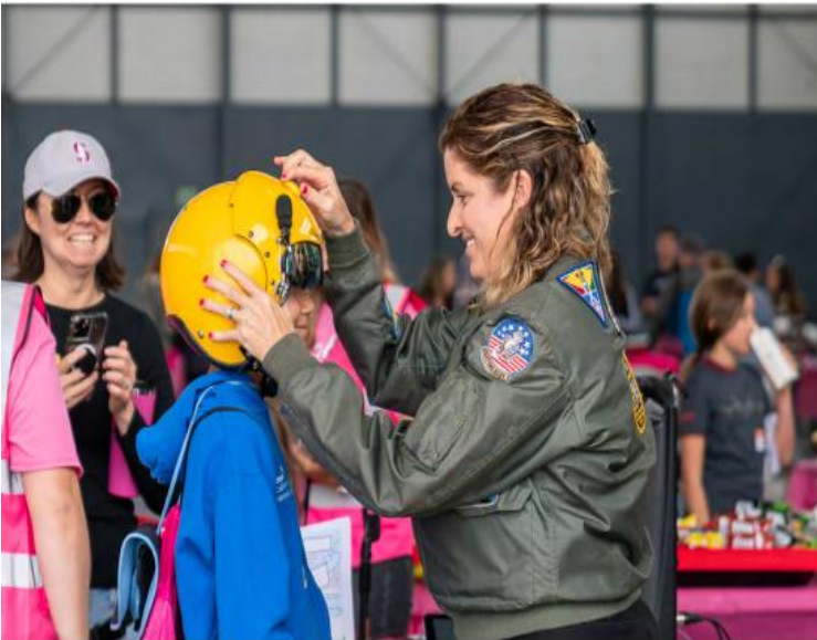
We hosted about 160 kids and their families at our hangar in Marina, California for Girls in Aviation Day.